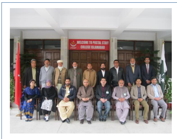
COURSE ON EFFICIENCY AND DISCIPLINARY RULES

A course on “Savings Bank and Pension Payment System” for one week conducted from 16-06-2014 to 20-06-2014.