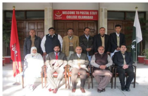
COURSE ON TRAIN POST