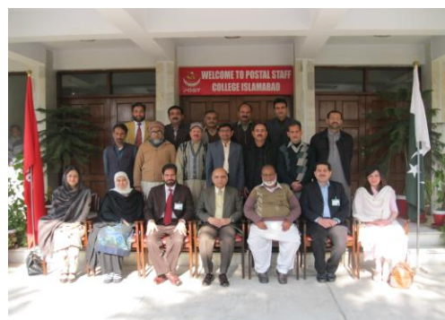
COURSE ON MARKETING STRATEGY

Postal Staff College in pursuance of its policy for imparting Technology based training to the officers of Pakistan Post has conducted 01 week course on “IPS new Web Based Complaint Management System (CMS) and Postal Suit Training” in which 36 Field Officers participated in which important topics as Express Mail Track and Trace System Application Management Reporting on EMTTS International Postal System Delivery Update System and its Reporting Complain Management System and its Reporting has been deliberately discussed along with Application Practice in Computer Lab.