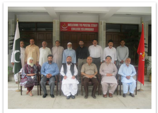
COURSE ON SAVINGS BANK AND PENSION PAYMENT SYSTEM