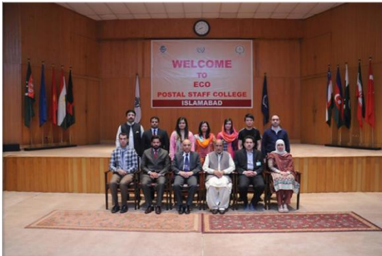
Managing Post as Business

Three weeks course was accompanied with Field Visits and Excursion Trips along with Classroom activities. The course helped the participants to develop strategies in a changing environment based on external and internal analysis which may be converted to executable actions within their area of responsibility.