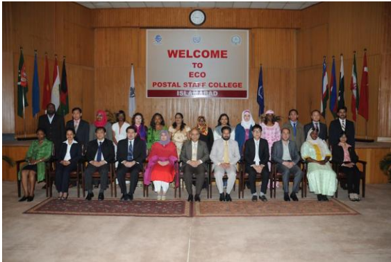
Strategy Formulation and Execution