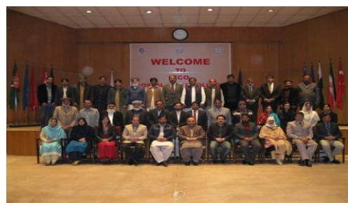
COURSE ON IT POSTAL SUIT

This course was conducted for one week as “Train Post for Faculty of ECO PSC, as well as for the Principal PTC’s” from 06-01-2014 to 10-01-2014. The course was designed according to the instructions and standards set by the Universal Postal Union. The aim of the course was to assert the faculty of the college and the Principals of PTCs with the knowledge and skills requirement set by the Universal Postal Union. The course was the first of its kind and nature. Lectures were delivered by the certified trainers of UPU.