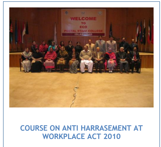
COURSE ON ANTI HARRASEMENT AT WORKPLACE ACT 2010

One week Workshop conducted on “Protection against Harassment of Women at Workplace Act 2010” from 11-02-2014 to 14-02-2014. The course was the first of its kind and nature on overview of Gender issues along with Introduction to Protection against Harassment of Women at Workplace Act 2010 and Responsibilities of Management and Employees for Complaint Procedure and the Role of the Ombudsperson and Pakistan Penal Code Section 509 for dealing such cases in Organization. The Workshop was conducted by the renowned NGO MEHERGARH which has a vital role in passing this law from the Parliament in 2010.